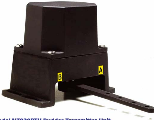
Model NT920RTU Rudder Transmitter Unit Dims 100mm x 165mm x 145mm (height)

Where Indicators are to be bracket mounted or externally located, a rugged pod assembly is available as an option which must be exercised to provide the necessary mounting assembly and weather proofing facilities