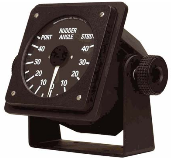
Model NT920RAI (PM) Pod Mount Assembly Dims 125mm x 125mm x 85mm (depth)

Simple 'on board' calibration and inbuilt facilities for fixed or variable intensity red scale illumination are also standard features.