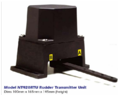
Model NT920RTU Rudder Transmitter Unit Dims 100mm x 165mm x 145mm (height)

Where Indicators are to be bracket mounted or externally located, a rugged pod assembly is available as an option which must be exercised to provide the necessary mounting assembly and weather proofing facilities