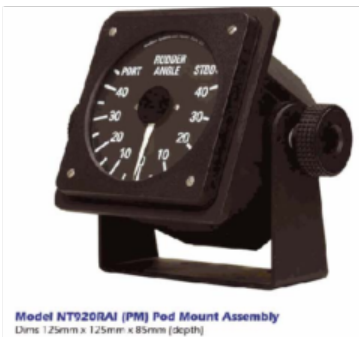
Model NT920RAI (PM) Pod Mount Assembly Dims 125mm x 125mm x 85mm (depth)

Simple 'on board' calibration and inbuilt facilities for fixed or variable intensity red scale illumination are also standard features.