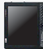
HE-775-Di Main Unit